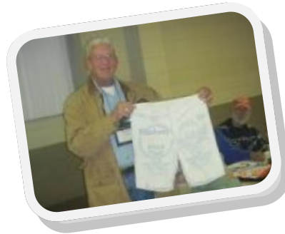
Sharing some memories at the January meeting...